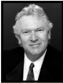
Robin Williams Film Festival Host